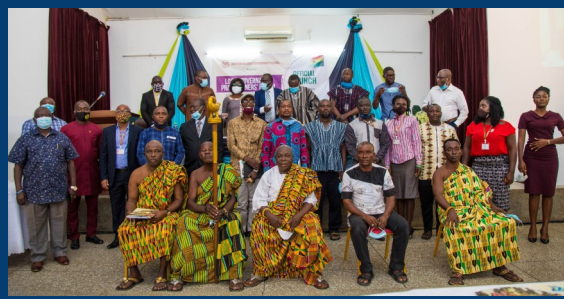
A group photograph of participants and partners